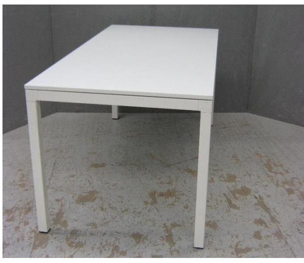
Photo 2 : Tested sample 220609-2 of Techo Fount Classic N-Leg office desk - side view