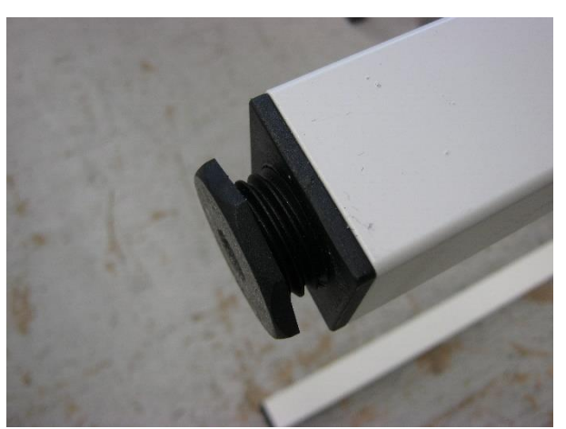
Photo 6: Tested sample 220609-2 of Techo Fount Classic N-Leg office desk - detail final leveller