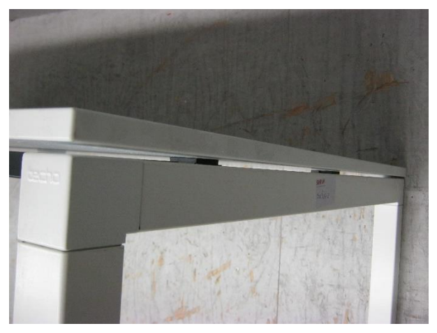
Photo 5: Tested sample 220609-2 of Techo Fount Classic N-Leg office desk -detail table top to legs side view

Report code: 22.0609-2 Date: May 1, 2023 Page: 8/14