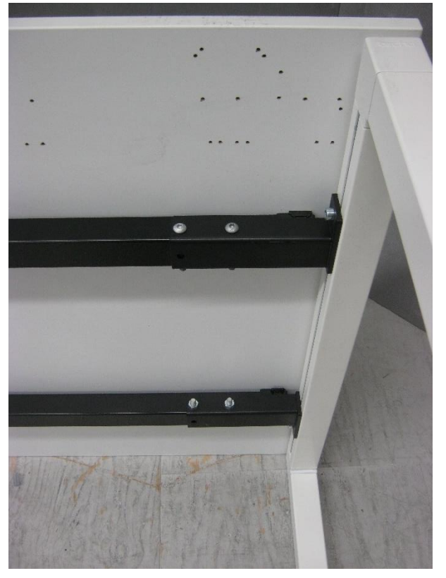
Photo 3 : Tested sample 220609-2 of Techo Fount Classic N-Leg office desk - bottom view