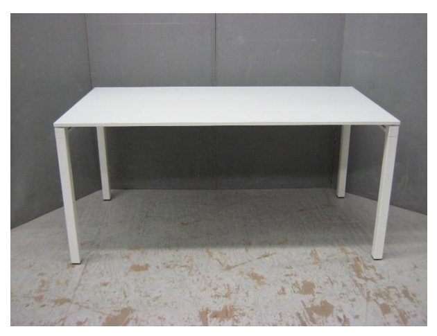
Photo 1 : Tested sample 220609-2 of Techo Fount Classic N-Leg office desk - front view