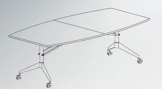
Desktops can be produced only in thickness 25 mm. Minimum table dimensions: 1050 x 2200 mm Maximum table dimensions: 1200 x 2400 mm