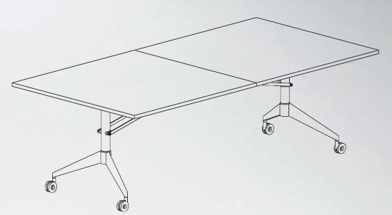
Desktops can be produced only in thickness 25 mm. Minimum table dimensions: 750 x 2200 mm Maximum table dimensions: 1200 x 2400 mm